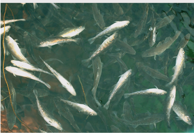
Fig. 2. Gadus morhua . Atlantic cod showing clinical signs of viral encephalopathy and retinopathy (VER). Infected fish show abnormal swimming behaviour, with looping and lack of coordination.

( vibrio ) anguillarum by the rapid agglutination test Mono-Va (Bionor).